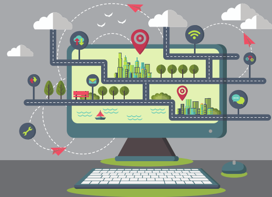
YOUR BUSINESS AND ERP

How we live and what we need from our home changes. A nursery might replace a dressing room, for example.